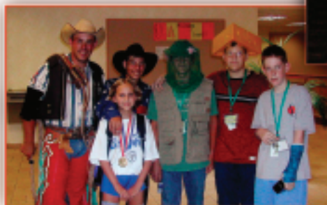
Dancing, canoeing or just having fun being together, those who attend UOA-sponsored events have a summer to remember.