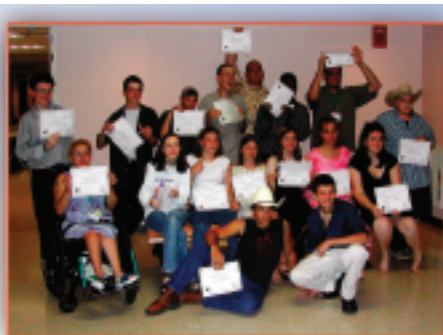
Games, contests, awards and rewards added to the excitement at UOA summer events.