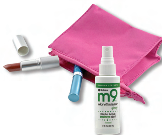
m9 Odor Eliminator Spray is an amazing hotel room deodorizer