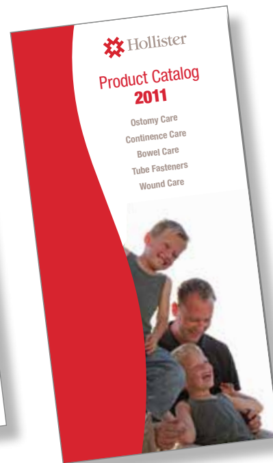
Full-Line Product Catalog (for clinicians)

As part of our continued effort to keep you informed of our products and educational materials, Hollister is pleased to announce that our new 2011 product catalogs are now available.