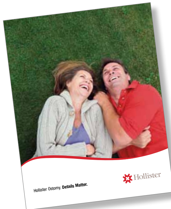
Ostomy Product Catalog (for people with ostomies)